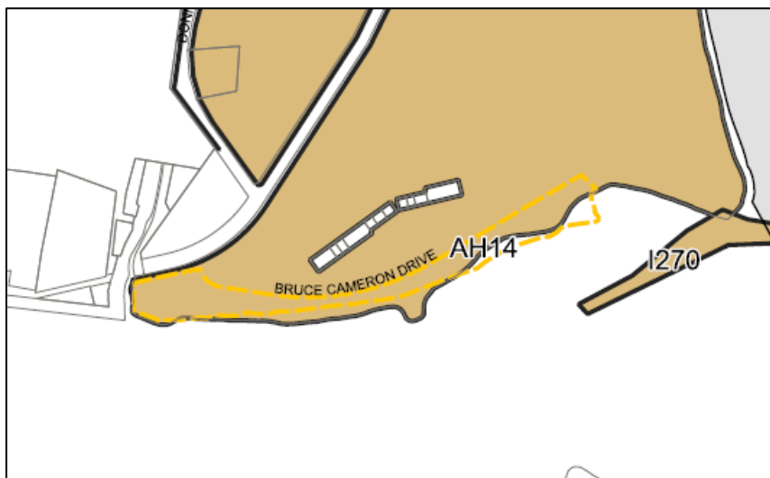
Figure 1: Extract of proposed amendment to Heritage Map Sheet HER_012A

The intended outcome is also to be achieved by a map amendment. An extract of the proposed amended Heritage Map showing the new HCA is provided in Figure 1 below. The full proposed map amendment is provided in Part 4.